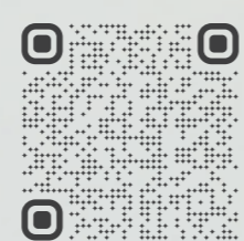
荷里活廣場 Plaza Hollywood