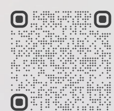
海港城 Harbour City