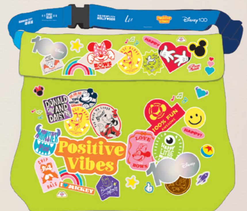
迪士尼100 兩用行李帶 連斜揸袋 Disney 100 Dual-use Luggage Belt with Crossbody Bag

Customers can redeem 1 Grand Prize “Disney 100 Dual-use Luggage Belt with Crossbody Bag” upon collection of all designated Commemorative Stamps from at least two malls on the same valid “Travel Journal”.