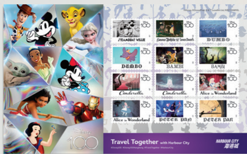
迪士尼100 郵票型貼紙 Disney 100 Stamp Stickers

Customers can redeem 1 Special Prize “Disney 100 Stamp Stickers” upon collection of 14 designated Commemorative Stamps of Harbour City on the same “Travel Journal”.