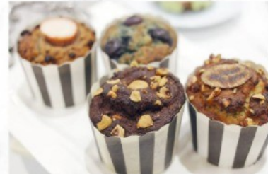
KETO SEASONAL MUFFIN (PLEASE CHECK WITH OUR STAFF FOR THE FLAVOR) $50