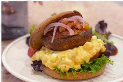
PORTOBELLO MUSHROOM EGG SALAD BAGEL KETO $98