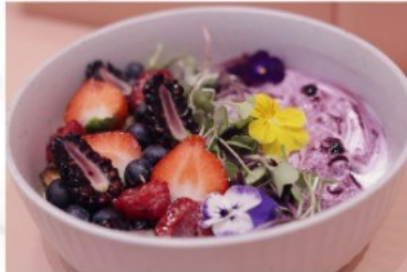
HOMEMADE GRANOLA GREEK YOGURT BOWL WITH SEASONAL FRUIT $72