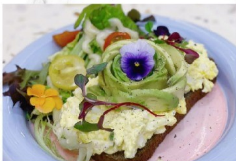
AVOCADO EGG SALAD TOAST $108 (UPGRADE TO KETO TOAST $25) AVOCADO, EGG MAYO SALAD, GLUTEN FREE VEGAN TOAST & MIXED SALAD