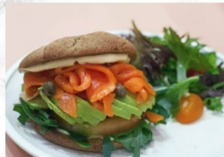
SMOKED SALMON AVOCADO BAGEL KETO $128