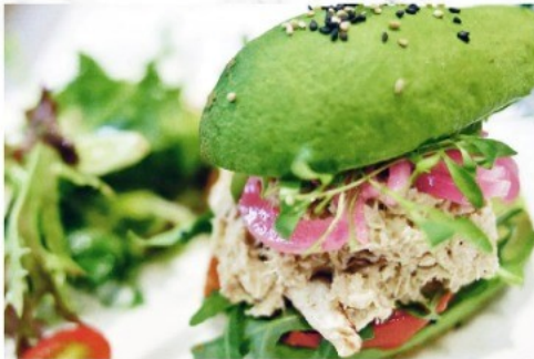
AVOCADO BURGER WITH CRAB MEATS LC $128