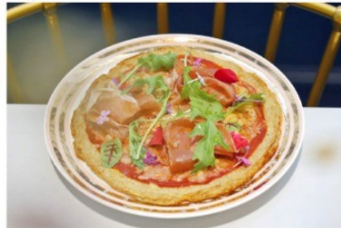
CAULIFLOWER PIZZA PARMA HAM $118 / MUSHROOM SPINACH $108/ SMOKED SALMON $138 KETO