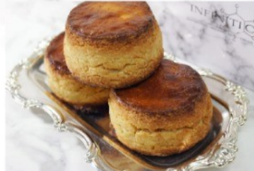
BUTTERY KETO SCONE (WITH BUTTER & KETO JAM) $48