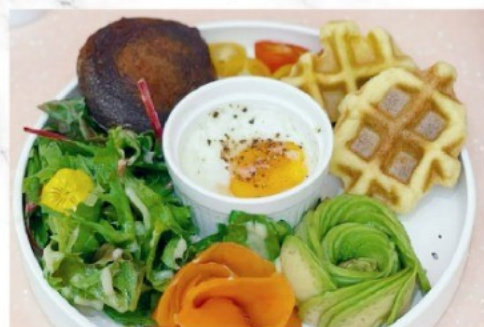
ALL DAY BREAKFAST LC $138 KETO WAFFLE PORTOBELLO MUSHROOM WITH VEGAN CHEESE AVOCADO, SMOKED SALMON, SOIL BOILED EGG & HEIRLOOM TOMATOES

VEGAN DAIRY FREE KETO SPICY LC LOW CARBS